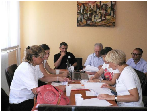
Meeting of JSC team members in Bor