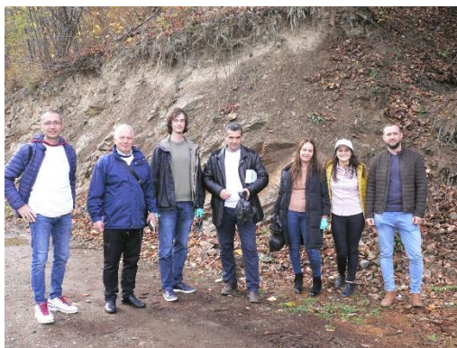
Taking samples of soil in Ocna de Fier