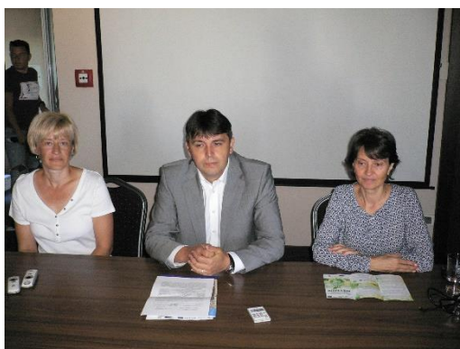
Two leading NETMIN ladies with UPT prorector