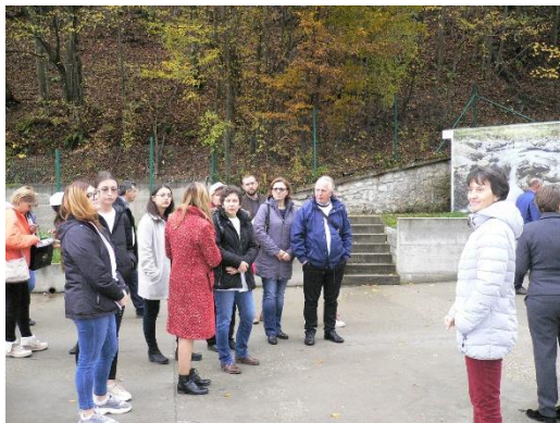
Workshop in Ocna de Fier