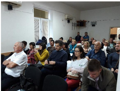
Workshop in Krivelj