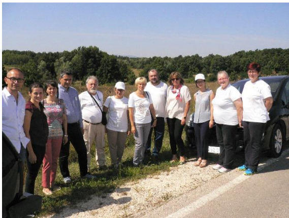
NETMIN team at the field near Bor

The partners recognize the need for joint efforts through the planned activities within the proposed project to achieve the set objective: forming of a network to improve the environment in the areas degraded by mining activities, with a tendency to get, based on joint scientific and professional work, positive results in terms of agricultural land remediation by applying phytoremediation, a cost-effective green technology.