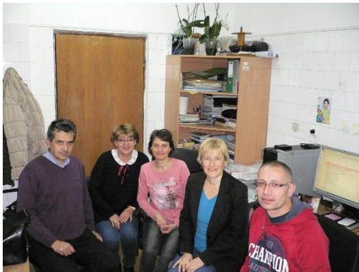
Meeting of JSC team members in Timisoara