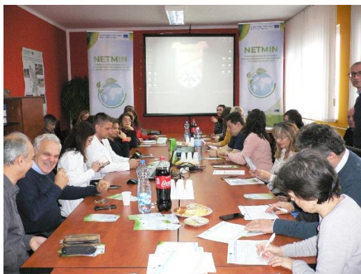
Workshop at MMI Bor